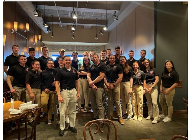
(November 10 th Parade March)